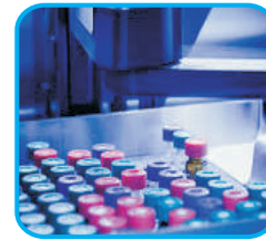
LABORATORY / R&D